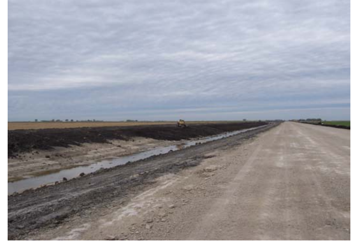
Near completion—top soil spread

The district, along with the landowners, are anxiously awaiting the completion of the ditch.